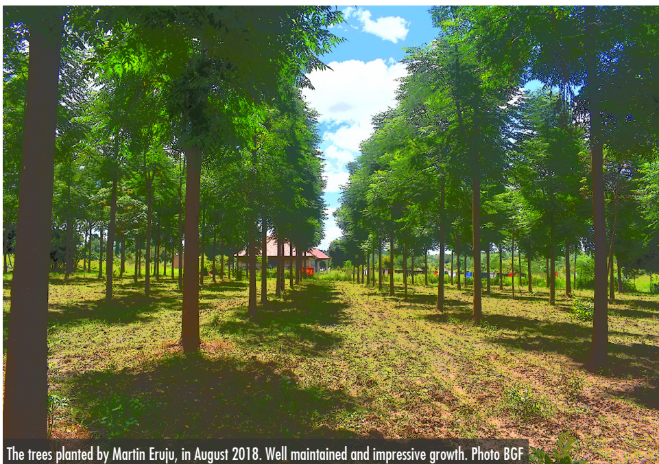
The trees planted by Martin Eruju, in August 2018. Well maintained and impressive growth.