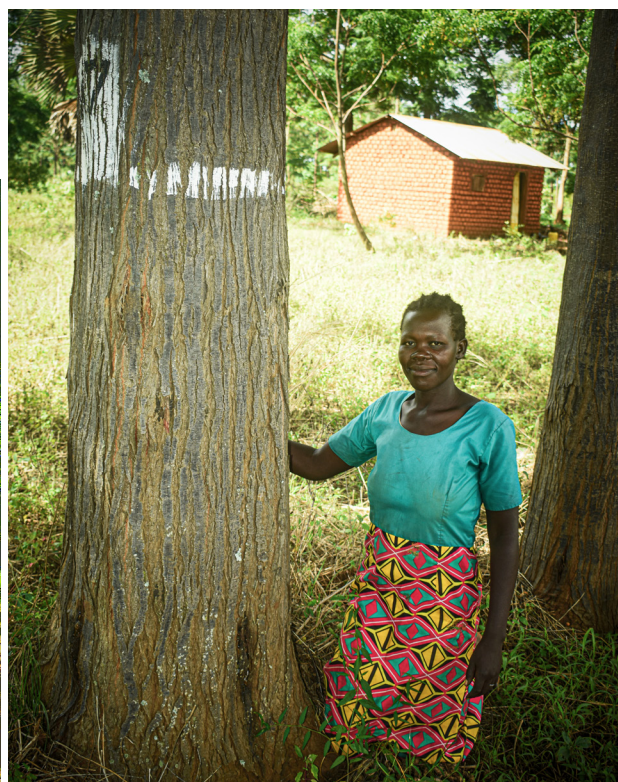
Unbelievable but true: this melia was planted in 2015, hence was 8 years old when this photo was taken (Abongowoo village, DBH 45cm).