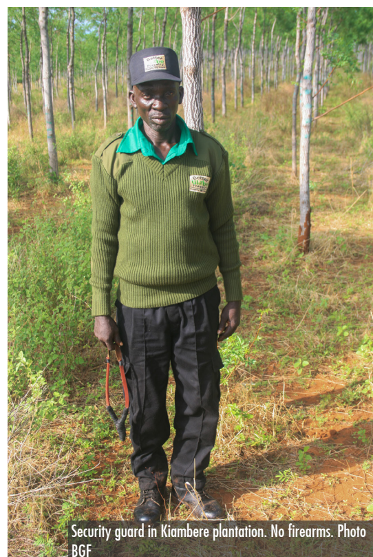
Security guard in Kiambere plantation. No firearms.

The company maintains a comprehensive training program that includes evaluations of the training sessions to ensure effectiveness and keep up with evolving needs. Overall, BGF recognizes the importance of training its employees, tailoring the training to their specific roles, and adapting to changing circumstances.