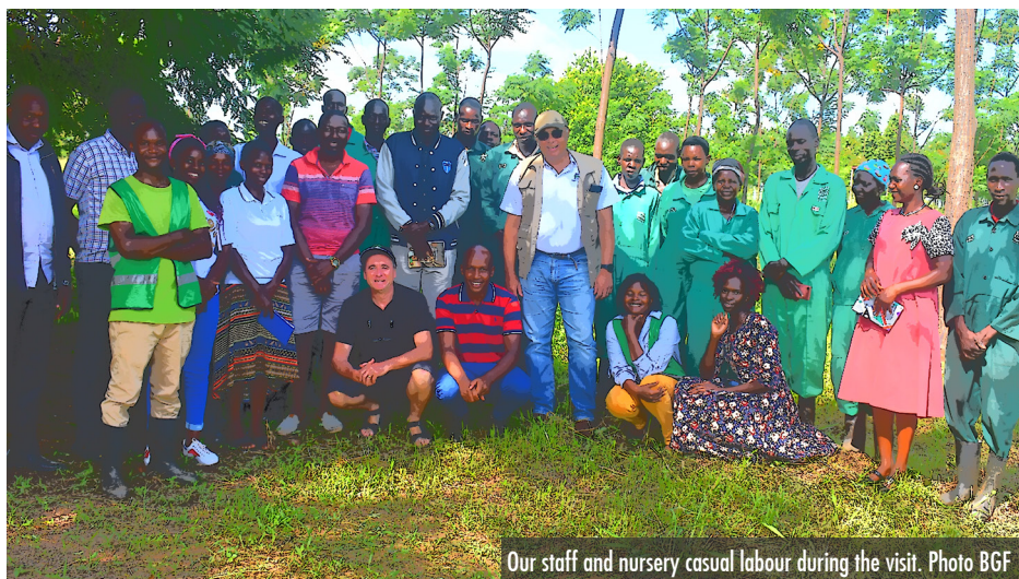
Our staff and nursery casual labour during the visit.

The initial trees were planted in August 2018, making