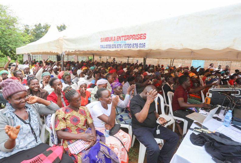
Many people attended the Annual General Meeting of the Village Bank

BGF was instrumental in establishing and funding two so-called "Village Banks" or Financial Services Associations (FSAs) in the north of Kitui County, the first one in Kasten Location (Nguni FSA) and the second one in Kamuwongo (Kamuwongo FSA). The last one was initiated in 2018 with the aim of improving livelihoods of farmers through loans and savings in the area of Seven Forks, where BGF is operating. Its 4 th Annual General Meeting was held on 4 th of May, with hundreds of farmers and stakeholders, to celebrate its achievements and progress, as well as getting the annual financial statement. This was presented by the auditor, indicating an increase in shares and savings leading to total assets worth 24.8m KES by end of 2023, which is up from 16.5m KES at the end of 2022. This led to an increase in dividend from 19 to 23 KES per share. So this Village Bank is in good health.